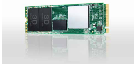
PCIe Gen3 x4 interface and NVMe standard

Transcend's MTE850 M.2 SSD utilizes the PCI Express® Gen3 x4 interface supported by the latest NVMe™ standard, to unleash next-generation performance. The MTE850 M.2 SSD aims at high-end applications, such as digital audio/video production, gaming, and enterprise use, which require constant processing heavy workloads with no system lags or slowdowns of any kind. Powered by 3D MLC NAND flash memory, the MTE850 M.2 SSD gives you not only fast transfer speeds but unmatched reliability.